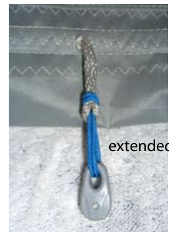
A kite which doesn't need the modification.

If the kite does not need the modification, it will have an extended link which connects the pulley to TP 6.