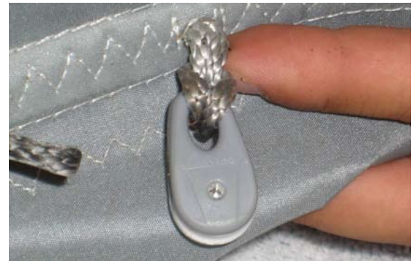
A kite which needs the modification.

If the kite needs to be modified, the pulley will be connected directly to the leading edge of the kite using a short larks head connection.